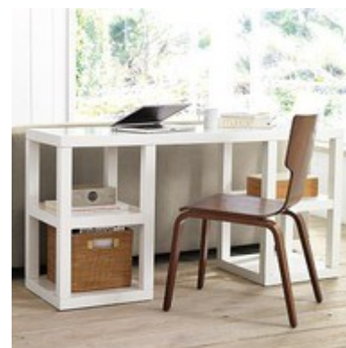
Desk & Chair