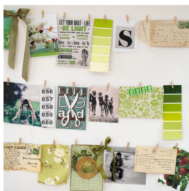
Cheap idea to hang